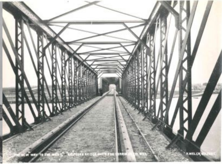
The former Clifden Railway Bridge.

The former Clifden Railway Bridge, also known locally as the White Bridge , formed part of the Clifden Railway, which closed in 1935. The bridge was dismantled three years later and sold for scrap. Three abutments which were formerly part of the Bridge are still visible in the River Corrib today, and will be used as the basis of the new bridge development.