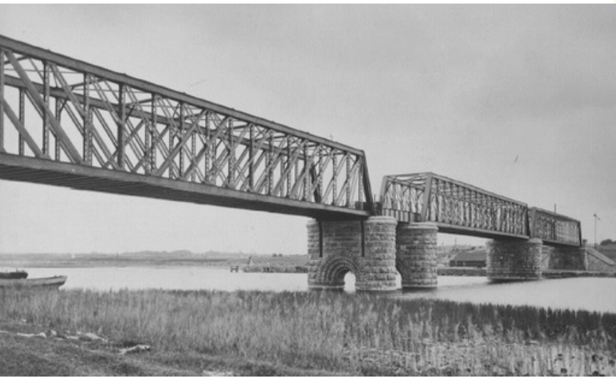
Seandroichead larnróid an Chlocháin.

Bhí seandroichead larnróid an Chlocháin, ar a dtugtar an Droichead Bán go háitiúil freisin, mar chuid d'larnród an Chlocháin, a dúnadh i 1935. Díchoimeáladh an droichead trí bliana ina dhiaidh sin agus díoladh é lena scríobadh. Tá trí abutments a bhíodh mar chuid den Droichead le feiceáil fós in Abhainn na Coiribe inniu, agus úsáidfear iad mar bhunús le forbairt an droichid nua.